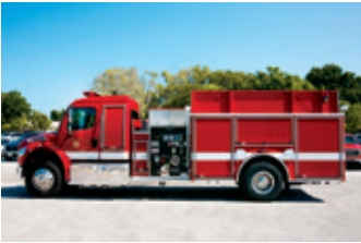
Extended cab – rollup door