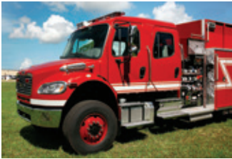
Freightliner M2-106, 4x4

Disclaimer: Some ratings not available with AWD or all cab styles.