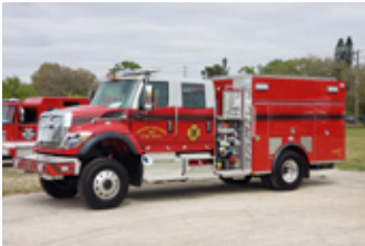
Extended cab pumper