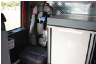
Crew cab with SCBA

Disclaimer: Some ratings not available with AWD or all cab styles.