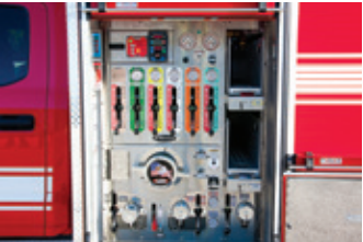
Ergonomically arranged pump controls engineered for serviceability