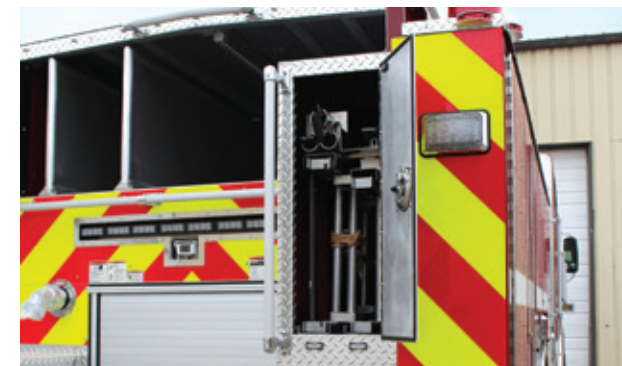
Chest height ladder storage