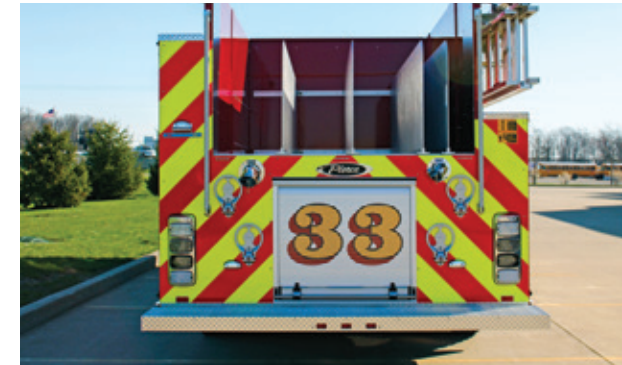
Low hose beds

We offer a robust line of customizable storage solutions to optimize space, response time, and firefighter safety.