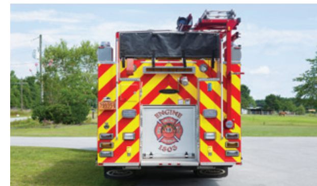
Aluminum, vinyl, netted, and rollup covers