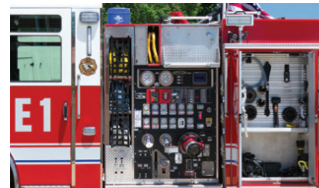
Flexible speedlay options